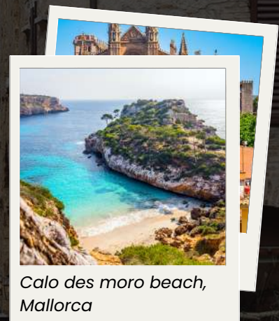
Calo des Moro beach, Mallorca

Mallorca, Spain, known for its stunning beaches and vibrant nightlife, is a clear example of overtourism. The rise of budget airlines and short-term rental platforms like Airbnb have brought in more visitors than the island can handle. As a result, the local infrastructure and resources are overwhelmed. The increase in tourists has caused housing prices to rise so much that some local workers, who are essential to the community, (1) . In response, residents have organized protests, demanding government intervention to control tourism and prioritize their needs.