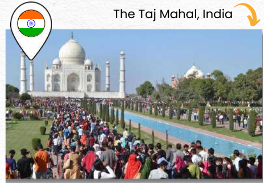
The Taj Mahal, India