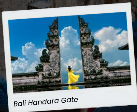
Bali Handara Gate

Bali, Indonesia faces similar challenges. While renowned for its natural beauty and spiritual culture, Bali has seen a huge rise in tourism, especially in popular areas like Canggu and Ubud. Social media and the idea that these places are "must-see" spots have brought even more visitors. This has caused traffic problems, environmental damage, and (2) are unhappy with the changes and say that tourism has made life worse for them.